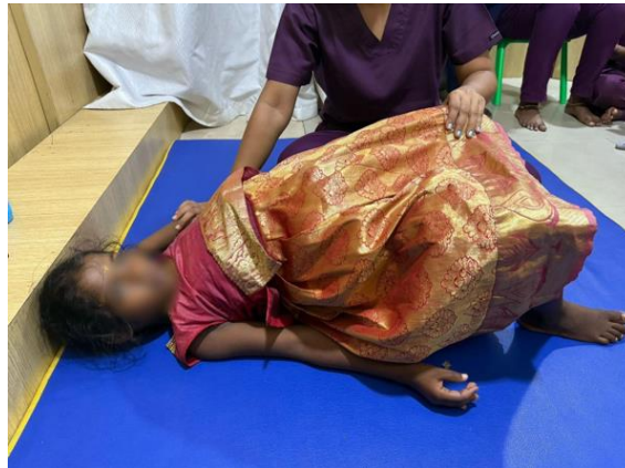
Photo 1: Facilitated Log-Rolling: Therapist Supports the Child's Pelvis And Shoulder While She Performs A Side-Lying Log Roll, Training Core Stability and Controlled Trunk Rotation on a Padded Mat.