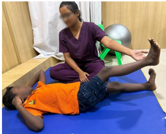
Photo 2: Supine Single-Leg Raise with Abdominal Crunch: Therapist Cues 45° Hip Flexion, Engaging Lower-Abdominal and Quadriceps Muscles While the Child Keeps the Opposite Knee Flexed and Hands Behind Head.