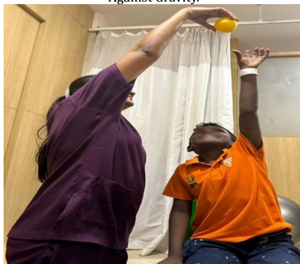
Photo 4: Reaching Task for Upper-Limb Activation: Therapist Holds A Target Overhead, Prompting Maximal Shoulder Flexion, Elbow Extension, and Visual Tracking as the Seated Child Reaches, Boosting Proximal Stability and Motor Planning.