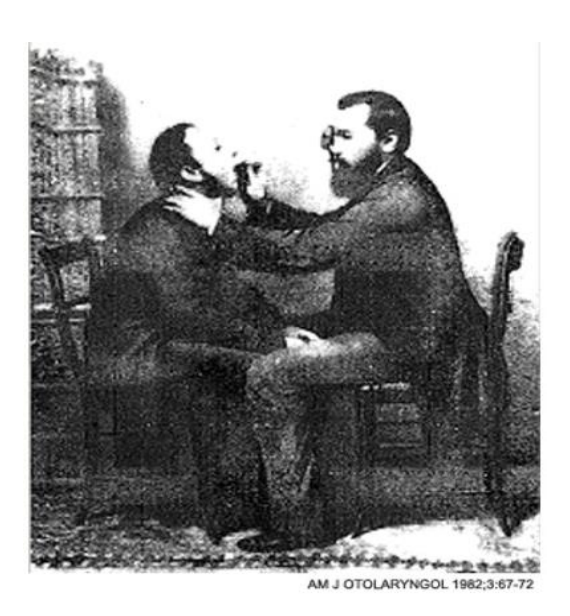
Czermak using his laryngoscope; the head mirror is held in the mouth. Head Mirror and Bull's Eye Lamp

hands-free operation of the head mirror, allowed for unparalleled visualization of the intricate structures within the ENT region.